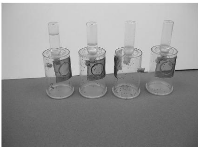
Figure 1. Chambers used for eye gnat feeding on aqueous solutions of insecticides in water with or without 5% sucrose.

Prolonged feeding: To test the effects of a longer feeding period, adult eye gnats were fed on 5% sucrose-insecticide solution for 24 h, and mortality was assessed immediately after the end of the feeding period. The same methodology as the 1 h exposure test was used in this experiment. Sucrose solution (5%) without insecticide was used as a control.