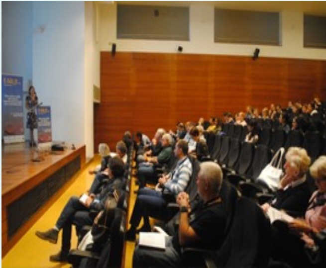
Conference in session