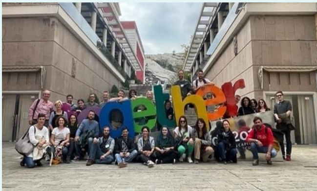
Fig. 1. Together” (Euro-SOVE Field Day, October 2022)

..... President’s Message cont’d on p 2.